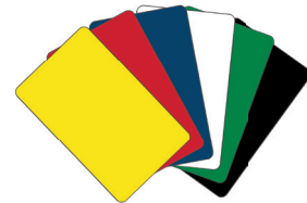
Solid Color Card Options